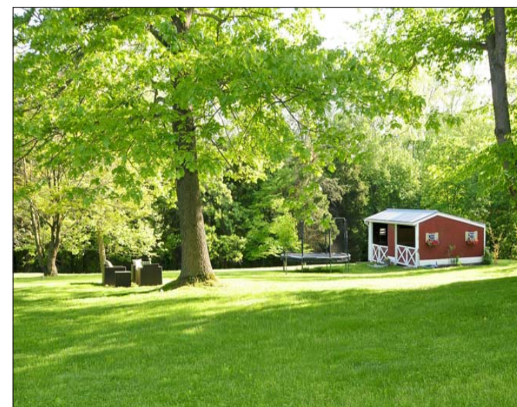
BACKYARD 2+ ACRES