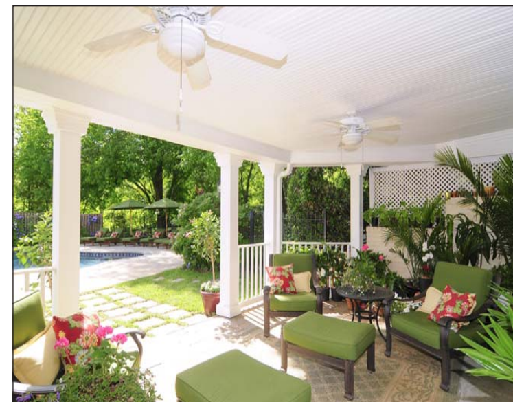
GUEST SUITE PATIO