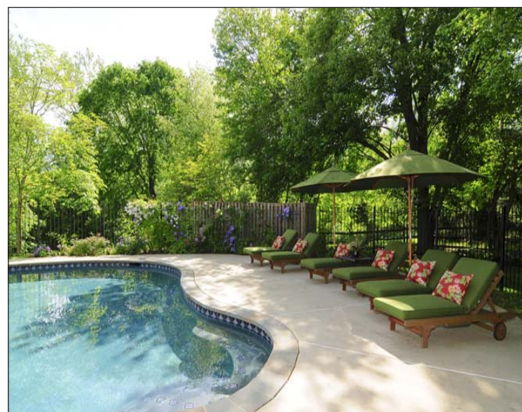
POOL & SUN DECK